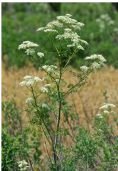
Poison Hemlock ( Conium maculatum ) Red dots on stems.