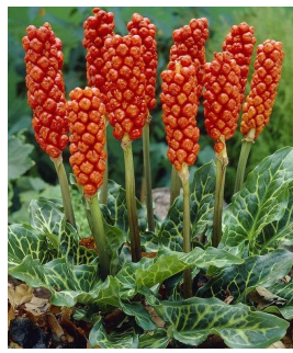
Cuckoo Pint ( Arum italicum ) Pale veins on leaves.