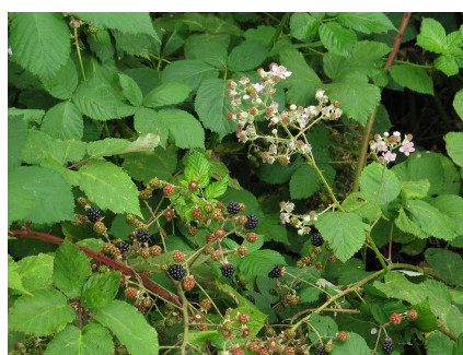
Himalayan Blackberry ( Rubus ameniacus ) Thorny with serrated leaves.