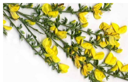
Scotch Broom ( Cytisus scoparius ) Bushy with sparse leaves and fuzzy seed pods.