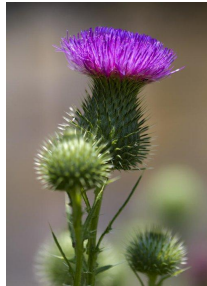
Bull Thistle ( Cirsium vulgare ) Tall with thin spiny leaves; pear-shaped blooms.