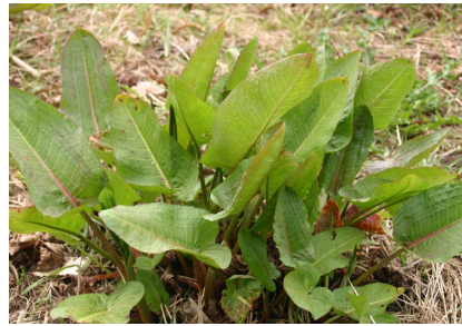
Dock ( Polygonaceae rumex ) Broad leaves and red stems.