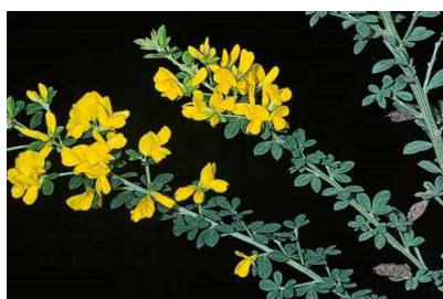
French Broom ( Genista monspessulana ) Groups of three leaves; hairy stems.