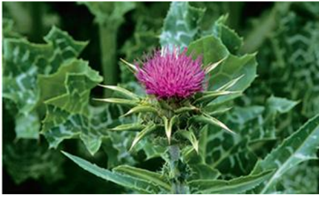
Milk Thistle ( Silybum marianum ) Spiny variegated leaves and spines around the flower.