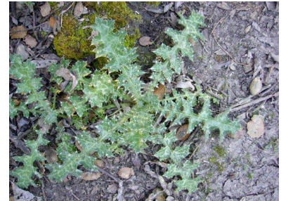
Italian Thistle ( Carduus pycnocephalus ) Spiny leaves with white veins.