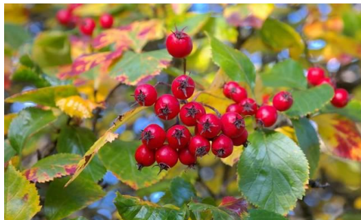
Hawthorne ( Crataegus sp.) Round, serrated leaves.