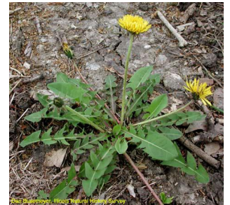
Dandelion ( Taraxcum ) Milky white sap.