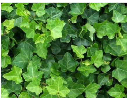
English Ivy ( Hedera helix ) Dense vine with glossy leaves.