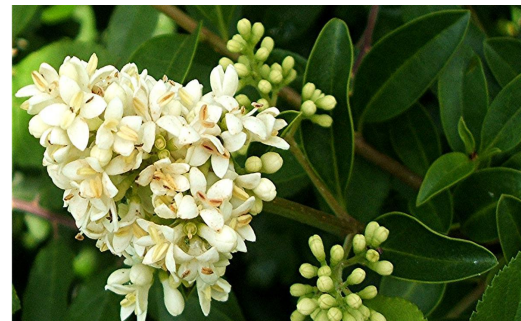
Privet ( Ligustrum sp.) Dark green glossy leaves.