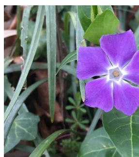
Periwinkle ( Vinca major ) Dark glossy leaves.