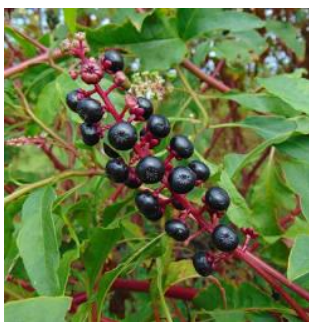
Pokeweed ( Phytolacca americana ) Red or purple stems.