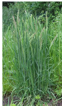
Velvet Grass ( Holcus lanatus ) Bases of round stems are white with pink stripes or veins.