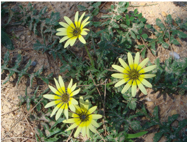
Capeweed ( Arcotheca sp.) Hairy leaves and stems.