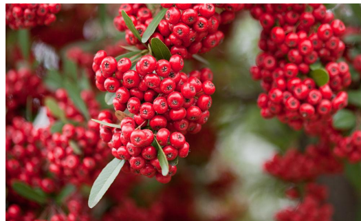
Pyracantha ( Pyracantha sp.) Elongated leaves and berry clusters.